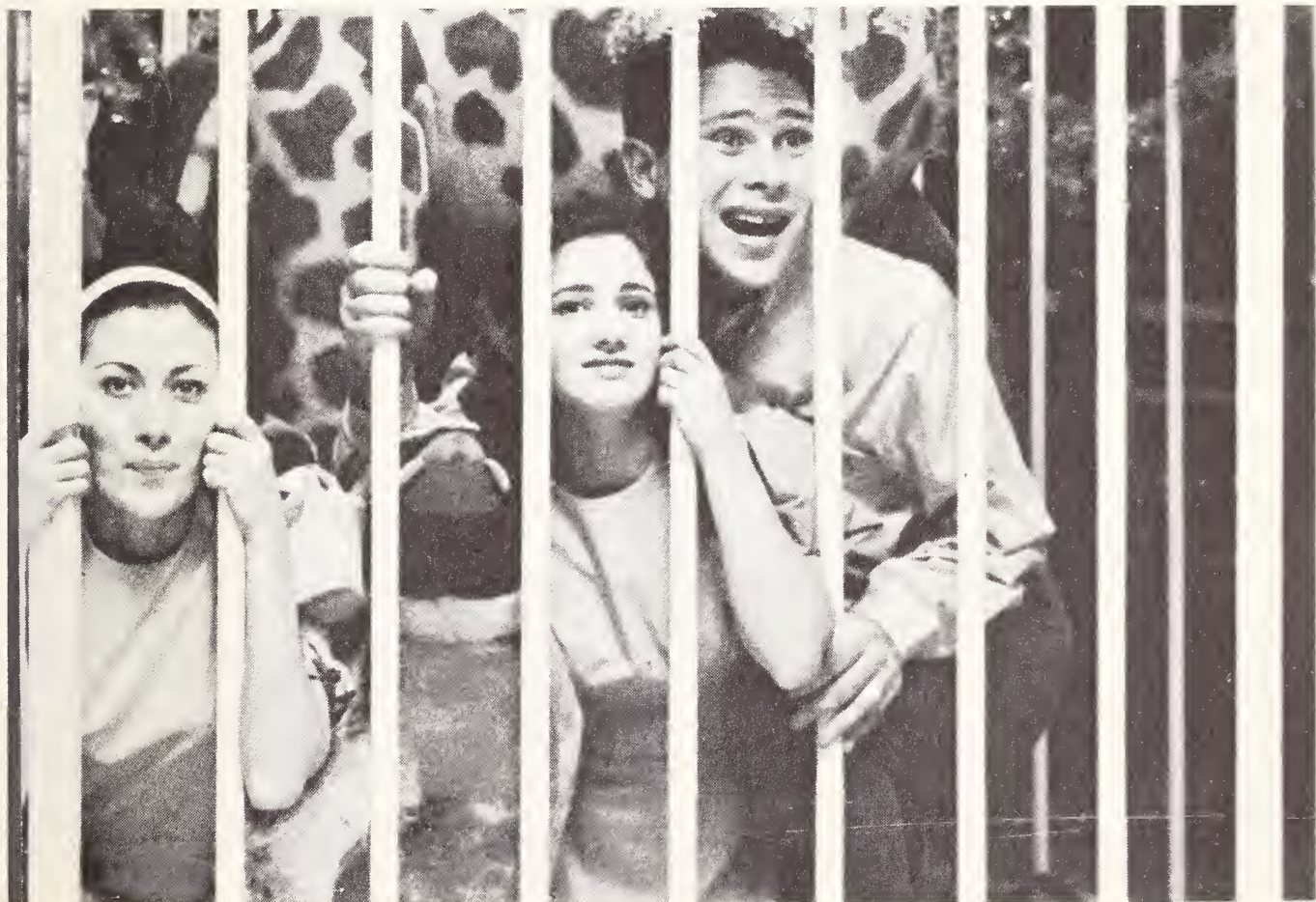
THE LOOKING GLASS REVIEW premieres on WBAI 9:30 AM, Feb. 26 and is rebroadcast Tues. 4:30 PM.